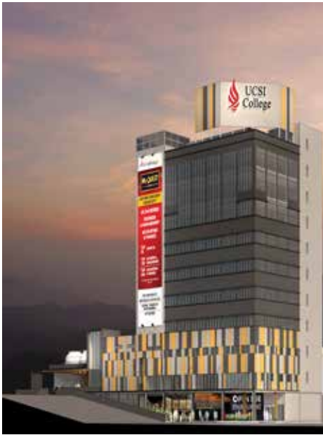
Digital image of the UCSI College campus.

UCSI College students can now share and utilize the facilities at UCSI University such as: