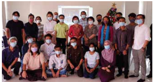
Group picture of the event.

communities; contributing to an increasingly digitalised world both economically and socially; benefitting from a sense of belonging wherever they live and becoming critical consumers and creators of media in a variety of forms. The internship was from 14 September to 18 December and the graduation took place on 20 December 2020 with a certificate giving ceremony by Dr Mabel Tan.