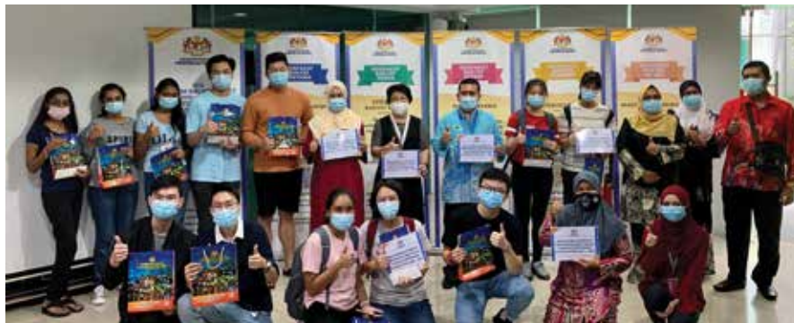
Ministry representatives with UCSI College students during the feedback session.

It is envisioned that this effort will have a positive impact on the unity of the country, thereby making Malaysia a peaceful and prosperous country.