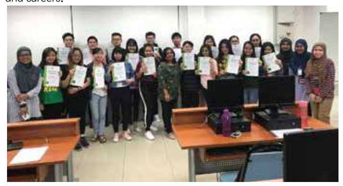
Well done! Participants with their certificates of attendance.

For the students, the training provided an added value to their portfolio and curriculum activity points. Students will be able to use the knowledge gained from this training in their future undertakings and careers.