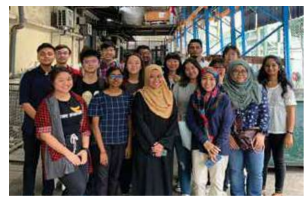
Group photo at the site.

Students were able to learn about computer processes and digital devices being segregated and dismantled for recycling. Old PCs still have a huge amount of reusable materials such as glass, steel, plastic and precious metals. As these materials are reused, they could help to minimise the construction cost for the new systems. As you recycle, there is lesser need to drain resources for manufacturing new things which in turn signifies less energy required for manufacturing.