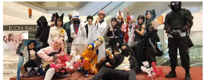
Group photo contestants.

On July 21st, 2023, the eagerly awaited Luna Cosplay Fiesta, organized by the UCSI College Student Council in collaboration with students enrolled in MPU2323 Introduction to Cultural Studies, marked a notable accomplishment following a sequence of planning refinements. The event commenced with a lively bazaar, featuring diverse booths offering food, drinks, and merchandise that attracted a broad audience. The IKON mall transformed into a colorful scene, adorned with anime, manga, and gaming characters brought to life by dedicated cosplayers who paid meticulous attention to detail.