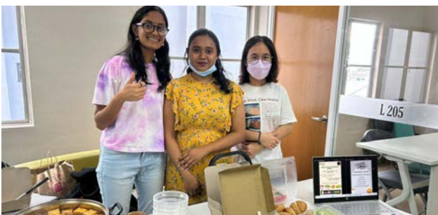
Sweet Bites of Tradition Exploring the Enchanting World of Kuih-Muih Delights!

The event spanned a week-long celebration, during which various activities and initiatives took place to immerse participants in the diverse food culture of Malaysia. The "Flavors Unite - Malaysian Delights" Foodie Week project achieved its goals of promoting cultural understanding, fostering unity, and celebrating the rich culinary heritage of Malaysia. By showcasing the diverse food culture of our institution, participants were able to experience a true sense of unity through shared appreciation for different cuisines and backgrounds. Additionally, the event's achievement is thanks to the enthusiastic participation of students and staff.