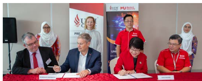
Sealing the Deal: A Moment of collaboration and progress as the MOA is signed.

Collaborating with other leading institutions is a win-win strategy as we can share teaching expertise and resources more widely and this enable students to study with us from across the globe. These