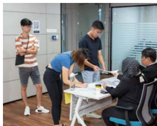
The event started with registration, followed by completing the surveys, convocation briefing, collection of robe and finally, collection of refreshment.

In conjunction with the 9 th Convocation Ceremony of the UCSI College Year 2023, a Homecoming event was organized by the convocation committee to welcome and celebrate the alumni that were on the graduand list. The event was held on the 4 th of August 2023 at UCSI College, Level 8, from 10.00 am.