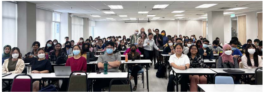
A group photo of the guest speaker, lecturers, and participants.