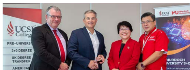
Forging New Pathways Through Strong Partnerships between UCSI College and Murdoch University.

collaborations mean students have flexibility in their study options and opportunities to expand their perspective in study life. Articulation partnerships with Murdoch University means that students study at their home institution and can complete their studies with a foreign degree.