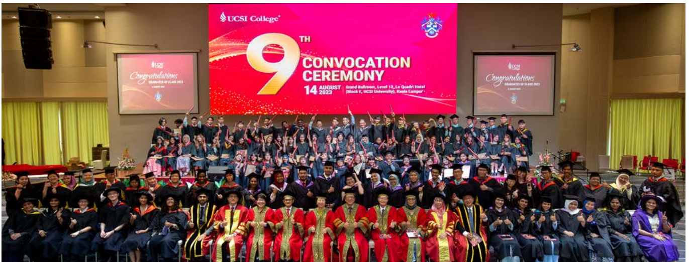
UCSI College Graduates of 2023.

UCSI College's Convocation 2023 was a momentous event that marked the culmination of years of hard work, dedication, and intellectual growth for its graduating students. Held on 14th August 2023, the convocation ceremony was a grand celebration of academic achievements and a testament to the promising future that awaits the graduates.