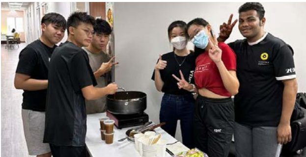
Spice-Packed Perfection Unveiling the Irresistible Charm of Curry Balls!

The Foodie Week event, titled "Flavors Unite - Malaysia Delights: Celebrating Diversity," was successfully organized through a collaborative effort between the UCSI College Student Council and students from Certificate in Business Studies taking MPU1313 Diversity in Malaysia. This event aimed to showcase the rich culinary heritage of Malaysia and celebrate the cultural diversity present within our institution.