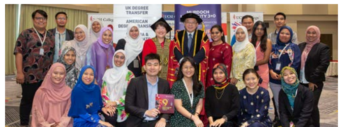
The driving force behind the scene - dedicated committee members.

UCSI College Convocation 2023 was a memorable event that celebrated achievements, acknowledged potential, and marked the start of a promising journey for its graduates. These individuals are not only ambassadors of their alma mater but also ambassadors of positive change in the world.