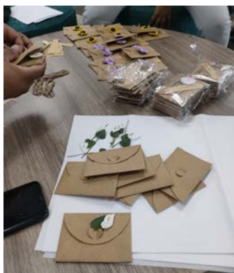
Folding of special cards.

From 12 th to 18 th May, the Drama and Theatre club organized an event, located on Level 2, with the aim of fostering appreciation among students towards their lecturers. The event targeted students and provided them with the opportunity to express gratitude to their educators through the purchase of gifts offered by the club. The primary objective was to strengthen the student-teacher relationship, creating a more harmonious educational atmosphere. This initiative