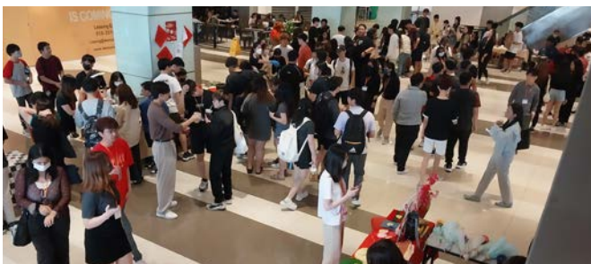
Booths offering food, drinks, and merchandise.