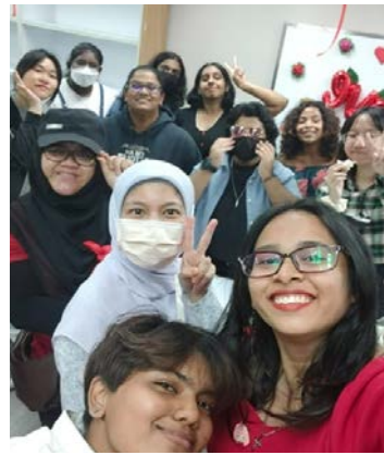
Group photo of the students with the lecturers that came by.

The Drama and Theatre club set up a booth for Valentine's Day on 17th February 2023. As soon as you stepped outside the elevator on floor 2, you could see decorations like balloons since it was all decked out in red. The club members had a booth set up right next to the pool table where they were selling brownies and handmade love messages that could be given as gifts to friends or loved ones. Both students and lecturers were purchasing the brownies along with the love letters to be given out to their loved ones. The purpose of holding it was to convey the joy of Valentine's Day.