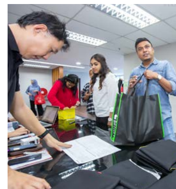
Lecturers and graduands collecting convocation robes from Lakaran Tuah Sdn Bhd, convocation partner for UCSI Group.

tradition, Bachelor's Degree and Diploma graduands were required to fill up the Ministry of Higher Education's Tracer Study. This year, we introduced three additional surveys, namely, the Sustainable Development Goals (SDG), Programme Educational Objectives (PEO) and Programme Learning Outcomes (PLO) Surveys. All these surveys play an important role in audits and quality compliance instruments governed by MOHE and MQA.