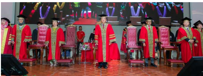
The Stage Party.

Management 3+0, in collaboration with Oxford Brookes University, UK. These recognitions served as a reminder that success encompasses not only academic excellence but also the ability to make a positive impact around them.