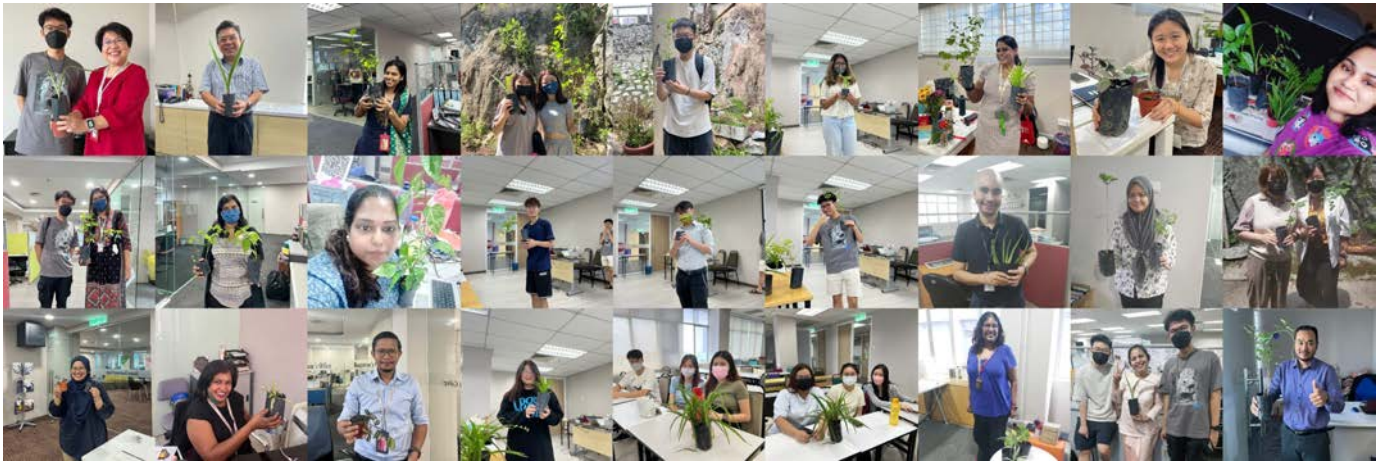
Proud plant adopters from UCSI College.

the importance of green spaces in the urban environments. By adopting a plant, the participants actively contributed to the mitigation of their carbon footprint and enhanced the air quality. This hands-on approach to environmental conservation resonated deeply, as it emphasized that even small actions could yield substantial positive effects. With its emphasis on sustainability, education, and community involvement, this campaign paved the way for a greener future while sowing the seeds of unity and ecological consciousness.